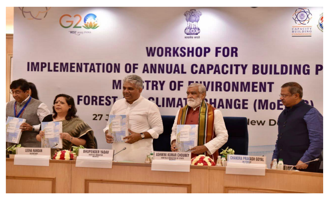
"Launch of the Annual Capacity Building Plan by Hon'ble Health Minister"

The plan aims to equip the healthcare work force with the latest advancements, innovations and best practices. It is surrounded by specialized training programs, workshops and knowledge-sharing in collaboration with training institutions under the Ministry of Health and Family Welfare.