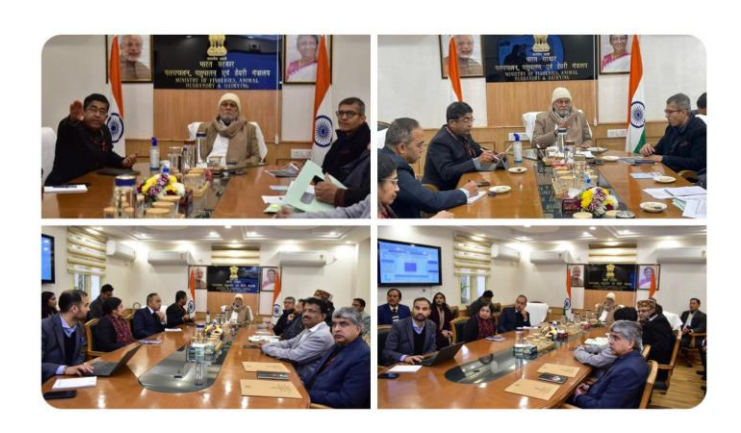
16:43 · 11/01/2023 · 875 Views · Twitter for Android

Reviewed the annual capacity Building plans prepared by #capacitybuildingcommission for @MinFAHD in presence of @PrvnPardeshi member CBC and Secretaries of @dept_of_ahd & @FisheriesGol.