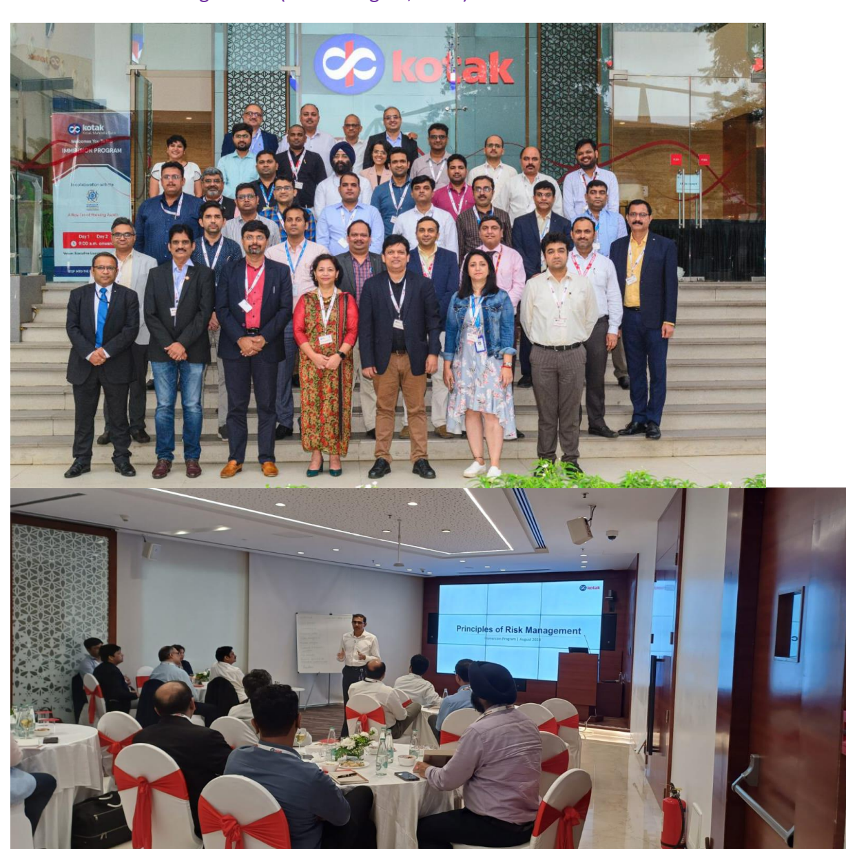
KMBL Immersion Programme (4<sup>th</sup>-5<sup>th</sup> August, 2023)