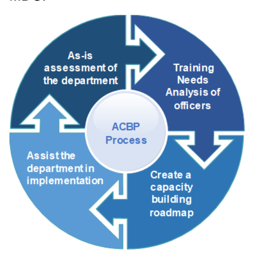
Figure 1: The process of Annual Capacity Building Plan (ACBP)

The Annual Capacity Building Plan (ACBP) is a strategic document that outlines key strategic areas that require intervention within the Ministry, Department, Organisation (MDO) and provides a macro picture of yearwise capacity-building initiatives that would cater to those areas. The ACBP is incremental in nature, identifying a few focus areas (in which the competency of the MDO – its officials, resources etc. needs to be built) that demand immediate attention and will gradually evolve into a full-fledged annual training calendar plan. The plan will follow a structured process of preparation as it involves working in tandem with all divisions within the MDO.